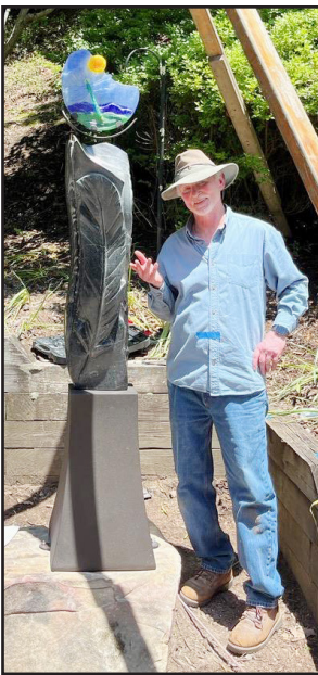
Peaceful Messenger Black Steatite Stone / Cast Glass / Steel